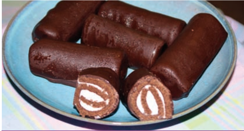
FRT00201 Swiss Rolls 3 Oz/ 52 CS

CHOCOLATE DINGS - Rich chocolate cake filled with Nana Maes 45 year old secret recipe, and then encased in Barry Callebaut chocolate. It is an all natural treat made with cage free eggs, hormone free milk and butter. "SO SINFUL YOU'LL HIDE THEM FROM THE KIDS"