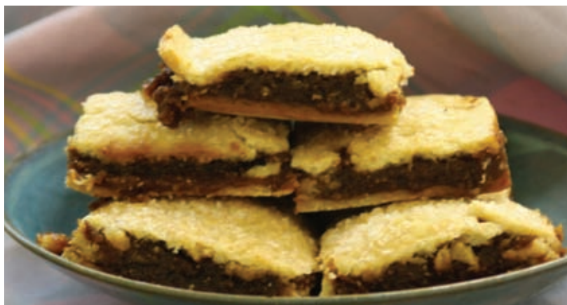
FRT00204 Old Fashion Fig Squares 5.6 Oz/40 CS

OLD FASHION LEMON BARS -It starts with our homemade lemon curd that is tart and sweet and just wonderful. The dough is made from scratch with hormone free butter and unbleached wheat flour. They are all natural and made by loving hands."JUST FOR YOU AND YOUR CLOSEST FRIENDS, YES THEY'RE THAT GOOD."