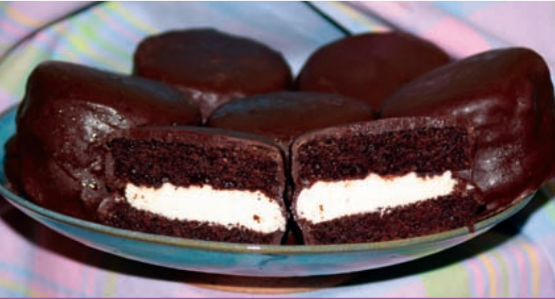
FRT00200 Chocolate Ding 4 Oz/40 CS

CHOCOLATE DINGS - Rich chocolate cake filled with Nana Maes 45 year old secret recipe, and then encased in Barry Callebaut chocolate. It is an all natural treat made with cage free eggs, hormone free milk and butter. "SO SINFUL YOU'LL HIDE THEM FROM THE KIDS"