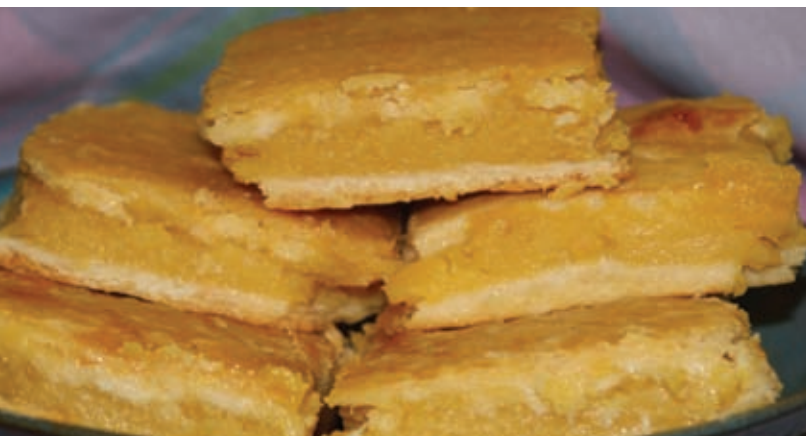
FRT00202 Old Fashion Lemon Bars 5.2 Oz/40 CS

SWISS ROLLS -Jelly roll sponge cake filled with Nana Maes 45 year old secret cream filling recipe that you won't find anywhere else! They are rolled by hand and then encased in Barry Callebaut chocolate. They are made all natural with cage free eggs, hormone free milk and butter. "PAIRED WITH A GLASS OF MILK AND YOU HAVE THE BEST SNACK AROUND."